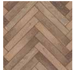
HERRINGBONE PATTERN 5/8" x 5" x 20" 5/8" x 7" x 28"

EXPECT TO SEE VARIATIONS IN COLOR, GRAIN, CHARACTER (INCLUDING KNOTS), & FILL FROM PLANK TO PLANK AND SAMPLE TO SAMPLE. ARTISTRYFLOORING.COM