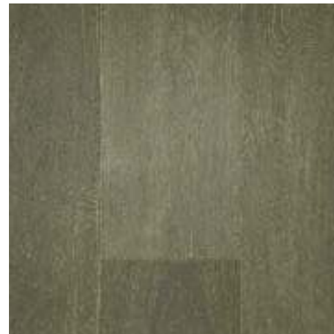
Burlap Oak 50172