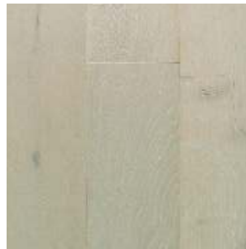
San Carlos Oak 50254