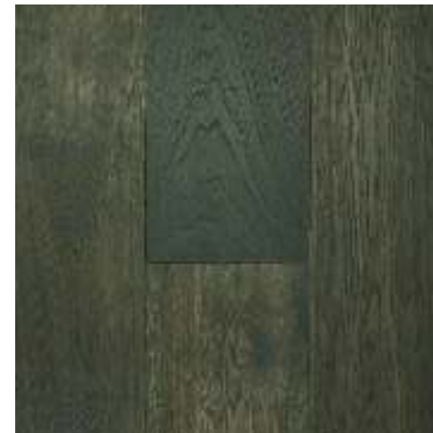
Autumn Oak 50175