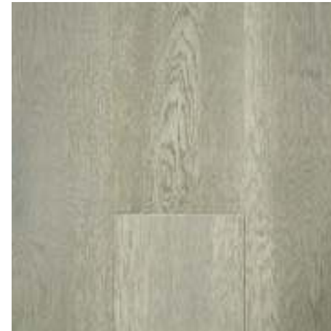
Paleo Oak 50255