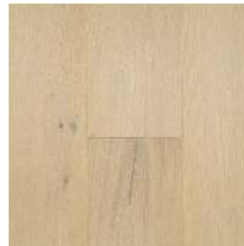
Arizona Oak 50174