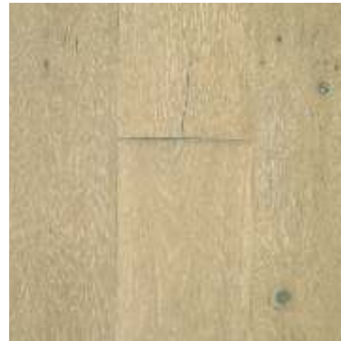
Bark Oak 50173