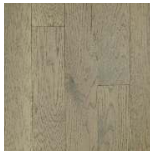
Fraser Oak 50241