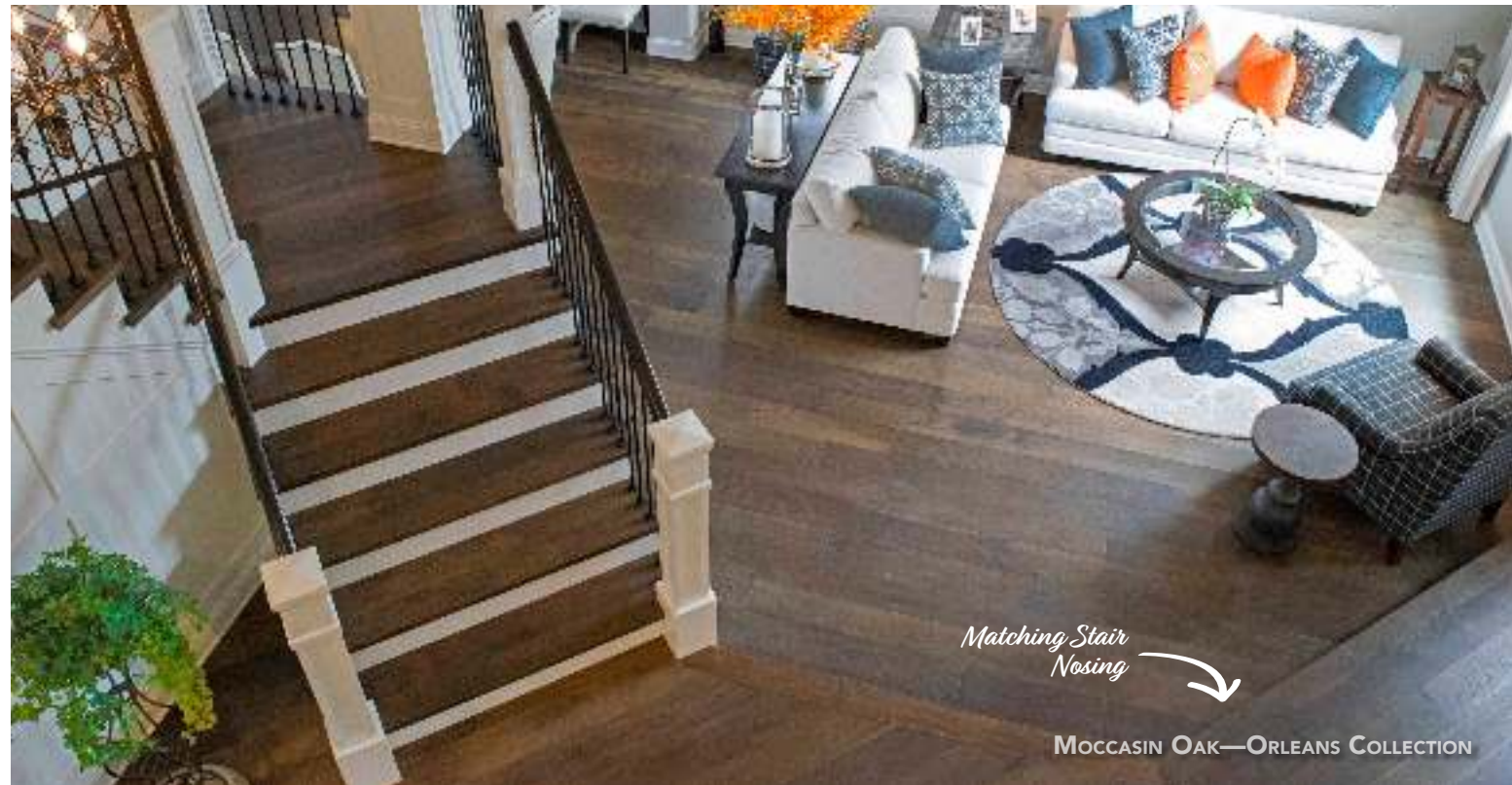
Matching Stair Nosing