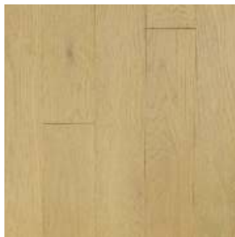
Hermosa Oak 50242