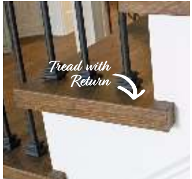
Tread with Return