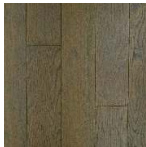
Toasted Oak 50240