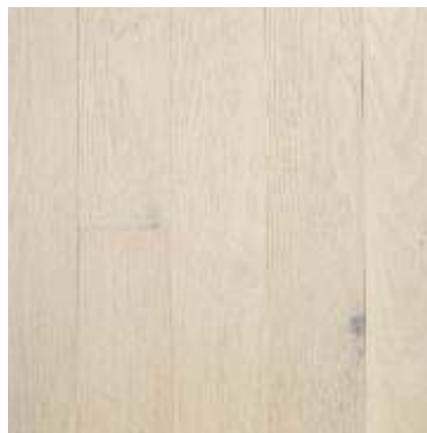
Winter Oak 50238