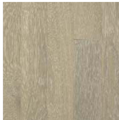
Ashland Oak 50199