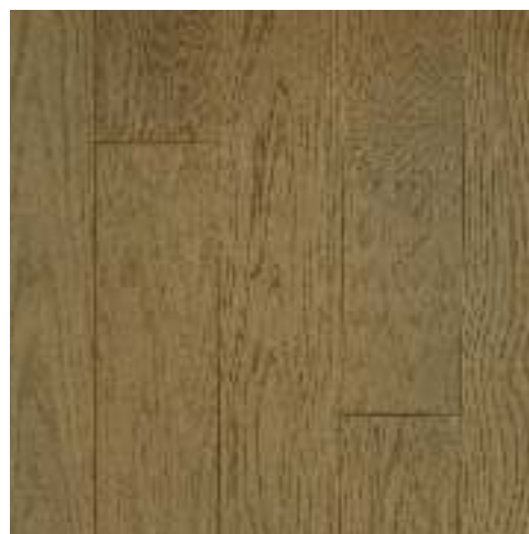
Brownstone Oak 50239