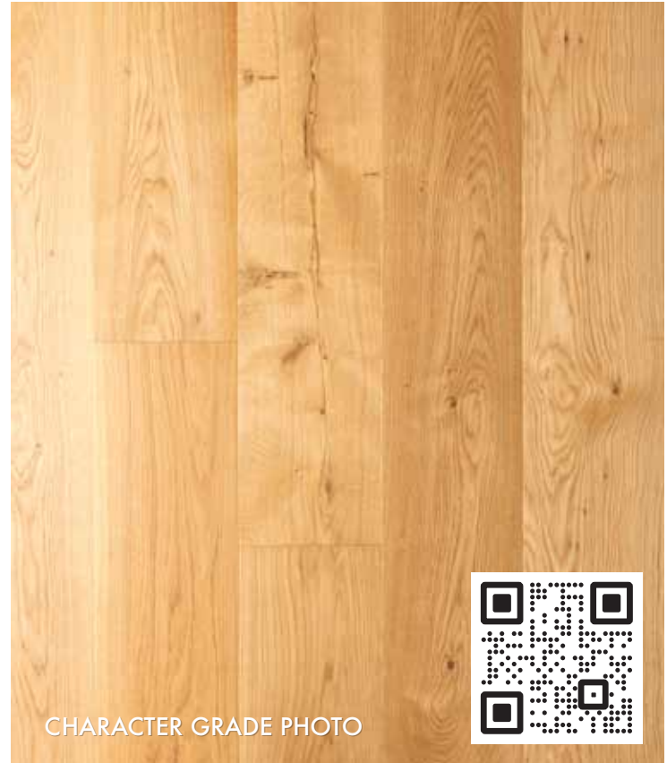
CHARACTER GRADE PHOTO

EXPECT TO SEE VARIATIONS IN COLOR, GRAIN, CHARACTER (INCLUDING KNOTS), & FILL FROM PLANK TO PLANK AND SAMPLE TO SAMPLE.