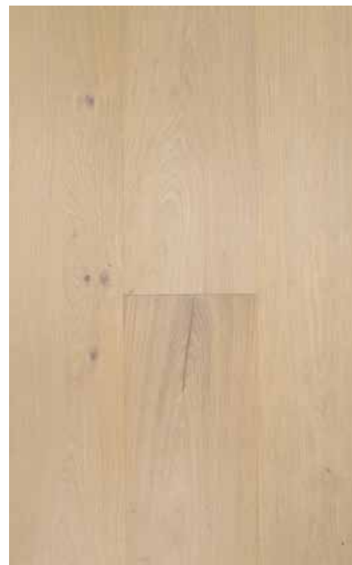
Arizona Oak 50174