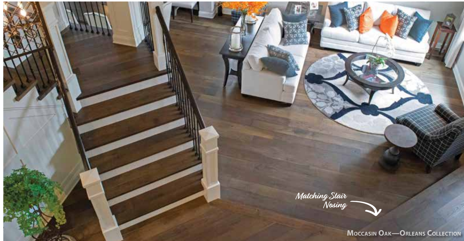
MOCCASIN OAK—ORLEANS COLLECTION