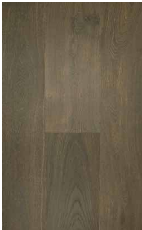
Burlap Oak 50172