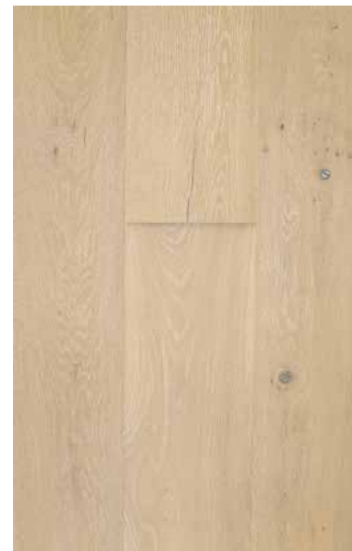
Toasted Oak 50173