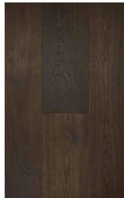
Autumn Oak 50175